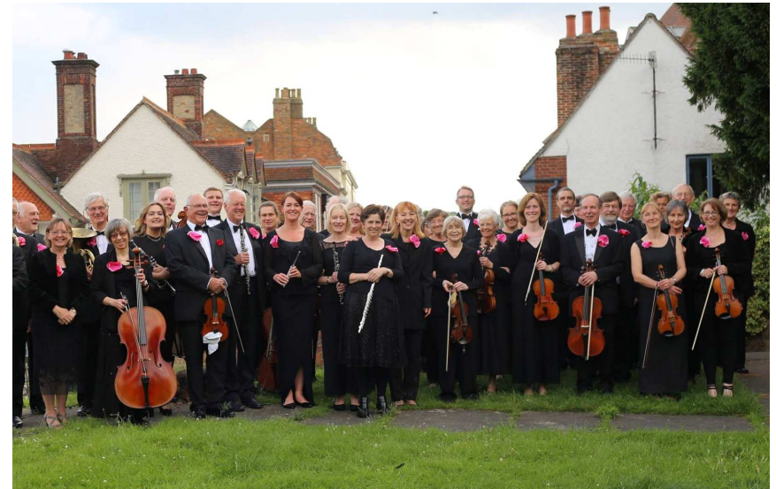
10th Anniversary Concert, June 2016